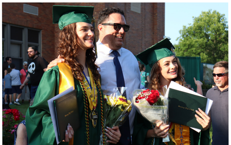
Onondaga 2025 Graduation