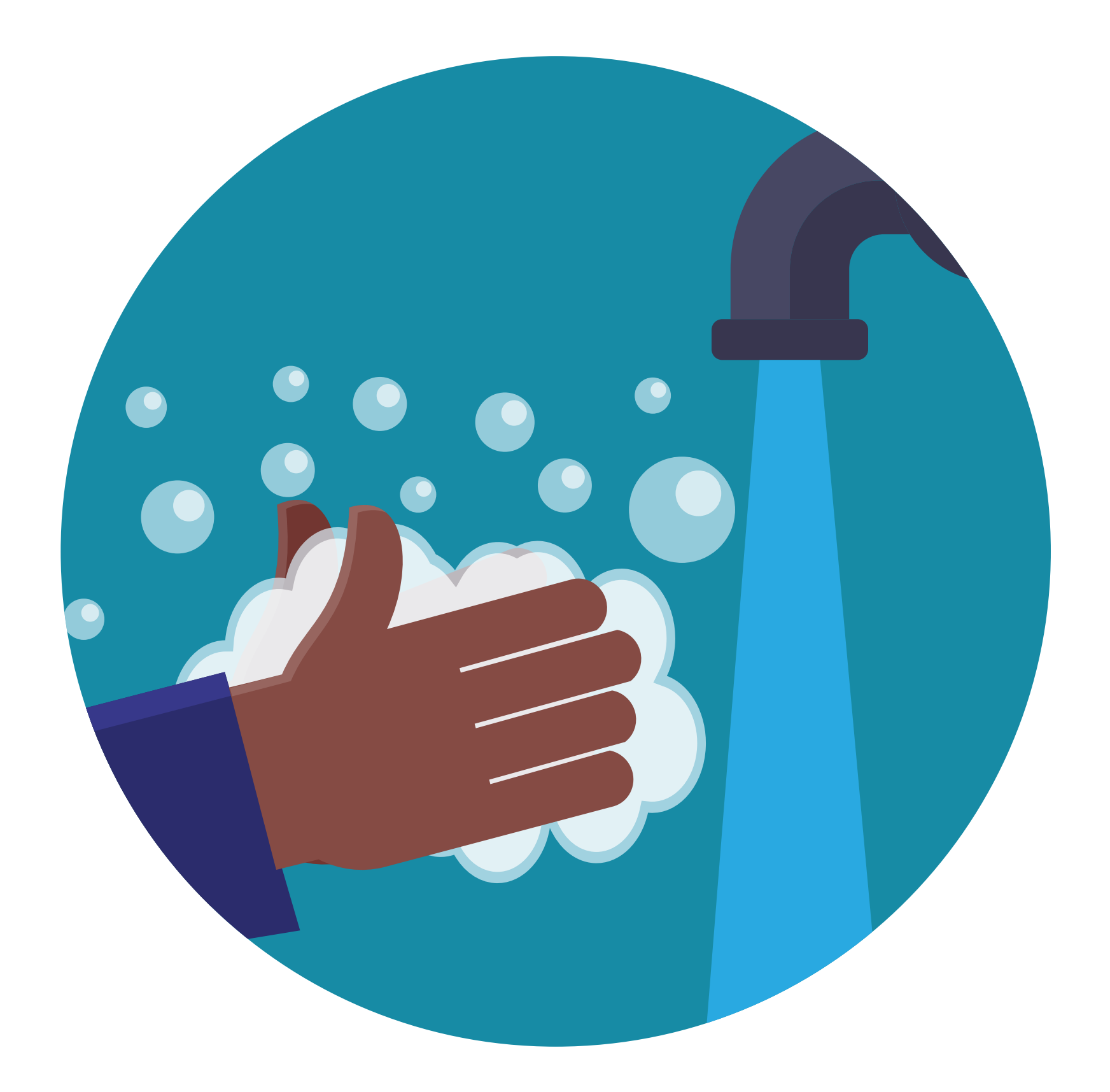
Wash your hands often