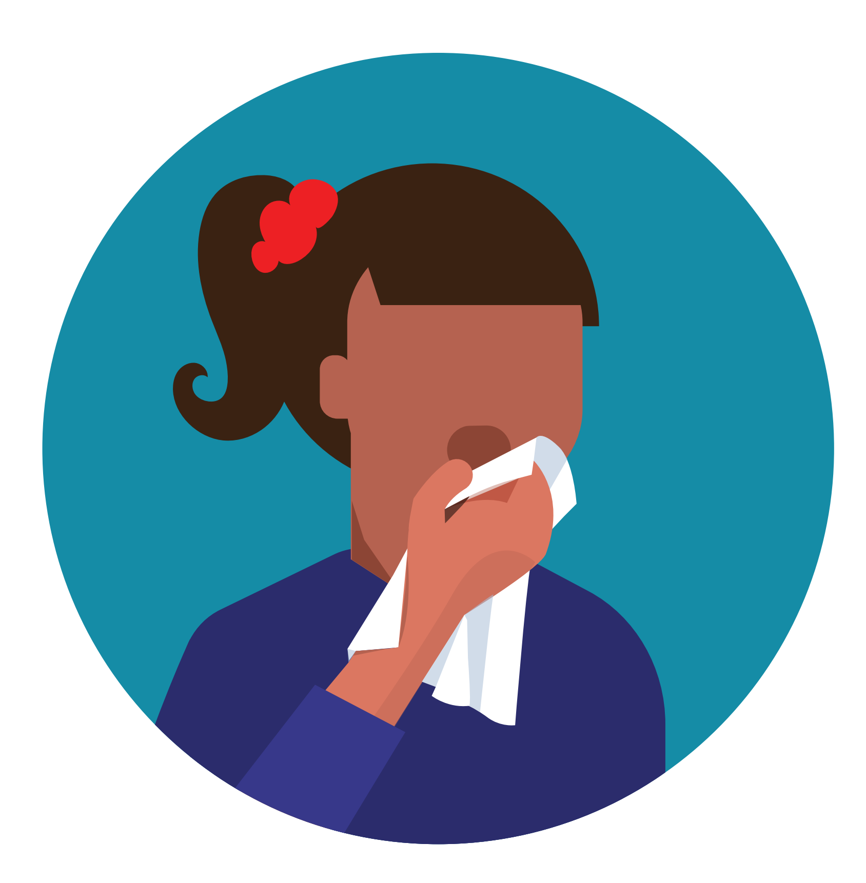
Cover your coughs and sneezes