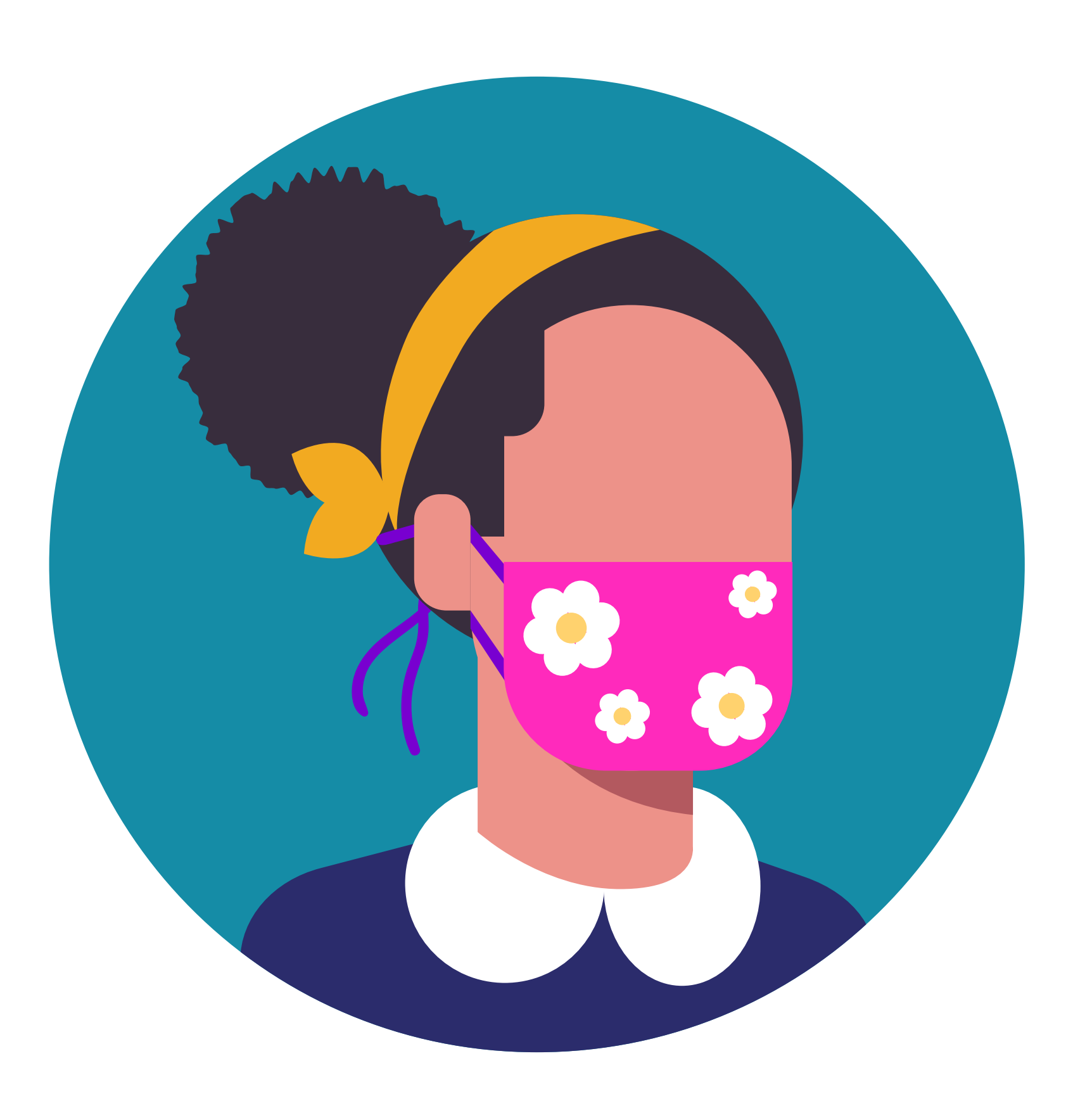
Wear a cloth face cover